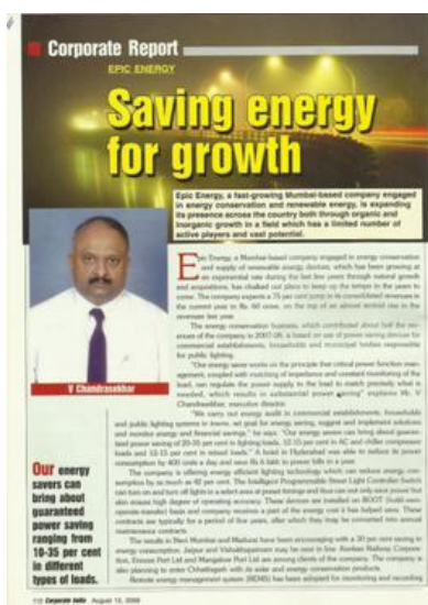
Featuring in Corporate india magazine to share some insights on energy efficiency

After completing 8 years in sujana group joined Epic Energy Ltd , a public limited company has executive director the company is listed in BSE and in the area of manufacturing Energy saving equipment and supplied equipment to various government and corporate segments