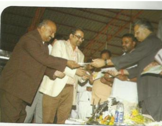
Receiving award from former Chatishgarh CM Raman Singh